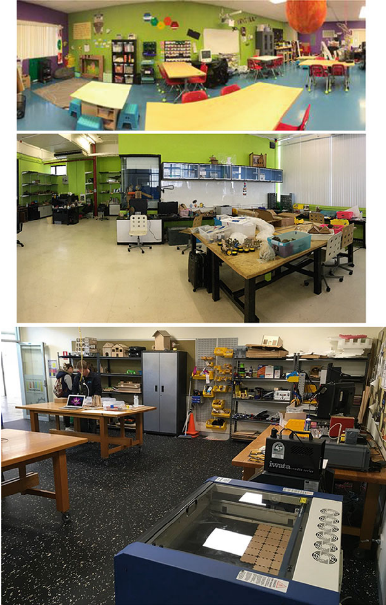
Fig. 5 Three different spaces for making and fabrication, in East Palo Alto, USA (top); Bangkok (middle), Thailand; and Melbourne, Australia (bottom)

overconsumption, stringent intellectual property, programmed obsolescence, and proprietary devices. Even though hackerspaces were inspirational for the