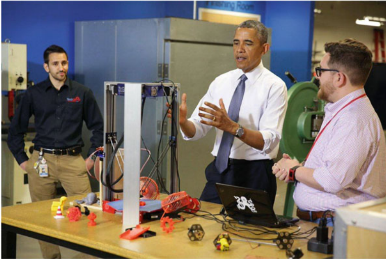
Fig. 1 President Obama at the first White House Maker Faire in 2014