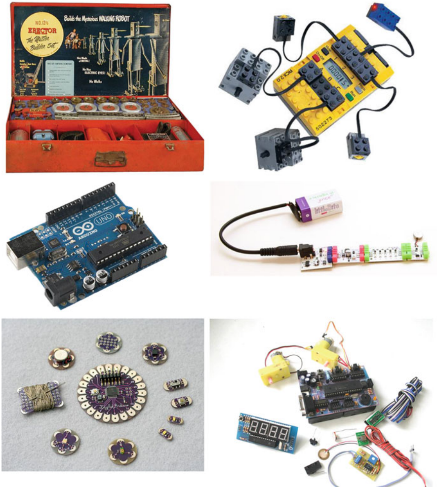
Fig. 4 The evolution of technology kits for children: the Erector Set (1940s), the Lego Mindstorms kit (1998), the GoGo Board (2001), the Arduino (2005), the Lilypad (2006), and LittleBits (2011)

education. Some of the seminal papers on digital fabrication and physical computing for children were published at IDC. Mike Eisenberg, in a visionary and trailblazing paper, first proposed the use of new “output devices” such as 3D printers in education (Eisenberg 2002), and Leah Buechley pioneered the use of e-textiles and new, flexible materials (Buechley 2006; Buechley and Eisenberg 2008).